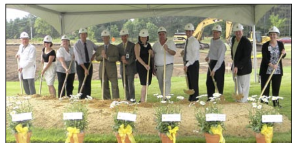
Ground breaking ceremony for the Westfields Hospital specialty clinic expansion project

The Specialty Center will include: 11 exam rooms, 2 procedure rooms; 1 consult room; 1 audiology room; 2 ENT rooms; and 1 cardiac stress test room