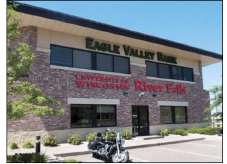
UW-River Falls Hudson Center

A grand opening is planned for September. For more information on the UW-River Falls Hudson Center, including a complete list of course offerings, hours of operations and direction, visit http://www.uwrf.edu/hudsoncenter .