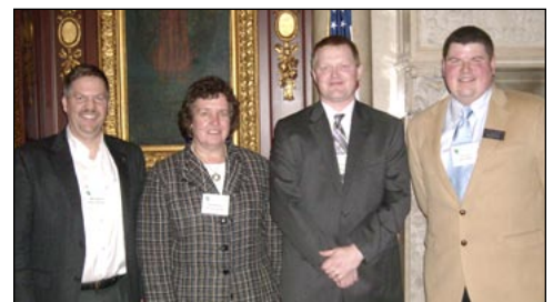
St. Croix EDC helped organize United St. Croix Valley Legislative Days from 2006-2009. St. Croix, Pierce, and Polk counties are all aligned with Momentum West, which will organize a legislative advocacy event in 2010.

Information on corporate sponsorships and registration will be available shortly.