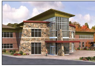
Exterior of the River Falls City Hall, 222 Lewis Street, River Falls WI

The 26,850 square foot facility is located at 222 Lewis Street, on a redevelopment site near the Kinnickinnic (Kinni) River. The city's administration, engineering, finance, community development, municipal utilities, and cable departments, along with the council chambers and municipal court, are located in the city hall.