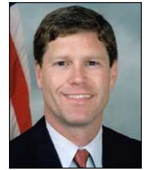
U.S. Rep. Ron Kind